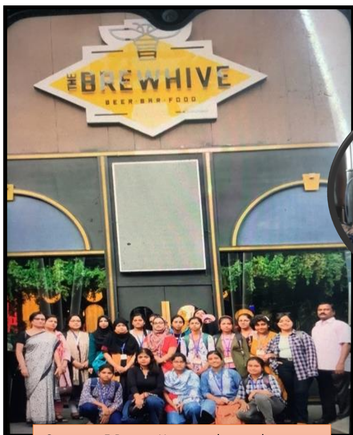
Semester 5 Botany Honours class at the entrance of the Brewhive.