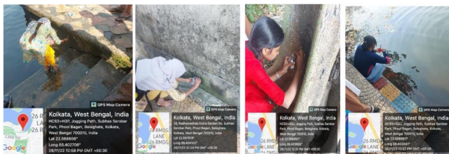
COLLECTION OF ALGAL SPECIMENS FROM VARIOUS HABITATS