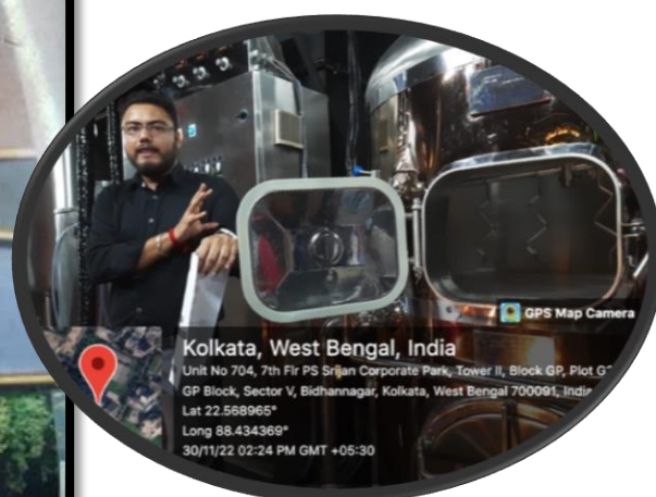
Demonstration of fermenter structure by the expert Brewer at Brewhive