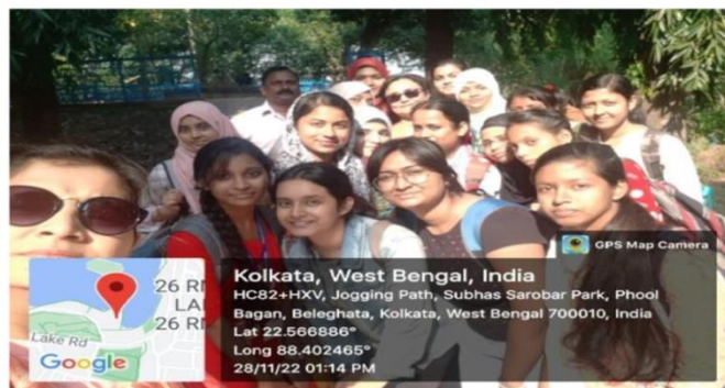
STUDENTS AND STAFF